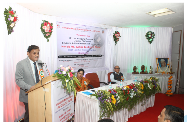
Hon'ble Mr. Justice Sandeep Shinde, Judge, Bombay High Court, Mumbai while addressing the participants in Seventh National Moot Court Competition, 2020