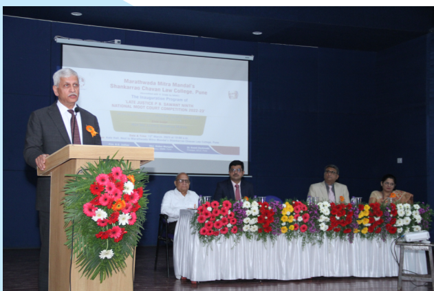
Hon'ble Justice Uday Lalit, Judge, Supreme Court of India addressing the participants in Ninth National Moot Court Competition, 2023