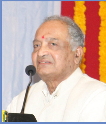
Late Justice P. B. Sawant Former Judge, Supreme Court of India