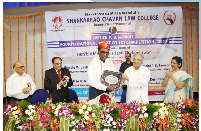
Hon'ble Justice P.B. Sawant, Former Judge, Supreme Court of India felicitating Hon'ble Justice Justi Chelameswar, Judge, Supreme Court of India in the Fourth National Moot Court Competition, 2017