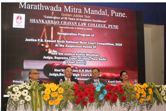
Hon'ble Justice Ashok Bhushan, Judge, Supreme Court of India & Hon'ble Justice Shriram inaugurated Justice P.B.Sawant Sixth National Moot Court Competition, 2019