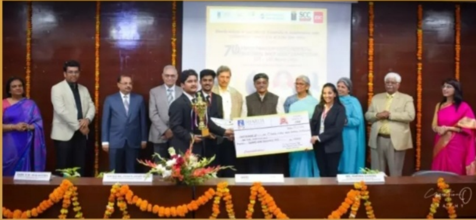
Winner team of 7th Anand Swaroop Gupta Memorial International Moot Court Competition, 2023