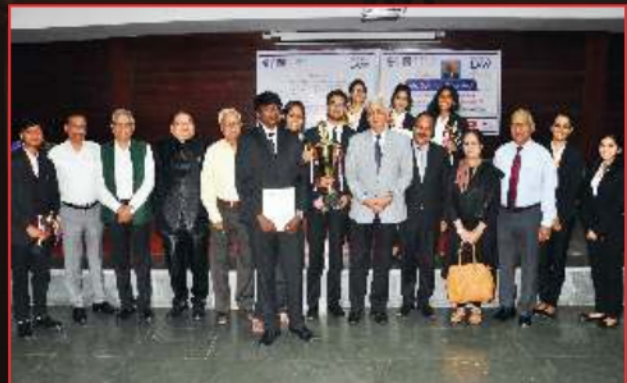
Winner team of 2nd Anand Swaroop Gupta Memorial National Moot Court Competition, 2017