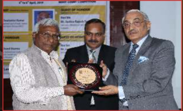
Hon'ble Mr. Justice Swatanter Kumar , Chief Guest in the Valedictory Ceremony of 4th Anand Swaroop Gupta Memorial National Moot Court Competition 2019