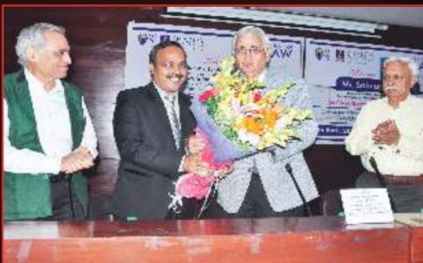
Hon'ble Shri. Salman Khurshid , Senior Advocate, Chief Guest in the Valedictory Session in 2nd Anand Swaroop Gupta Memorial National Moot Court Competition, 2017