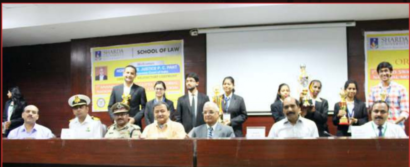
Winner team of 1st Anand Swaroop Gupta Memorial National Moot Court Competition, 2016