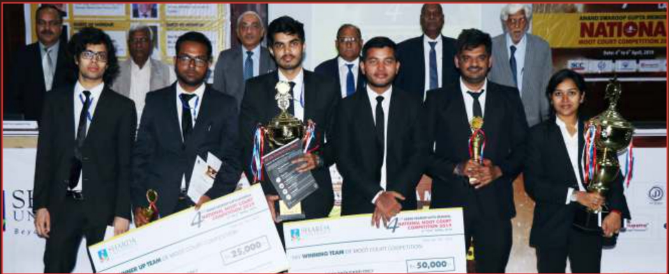
Winner team of 4th Anand Swaroop Gupta Memorial National Moot Court Competition, 2019