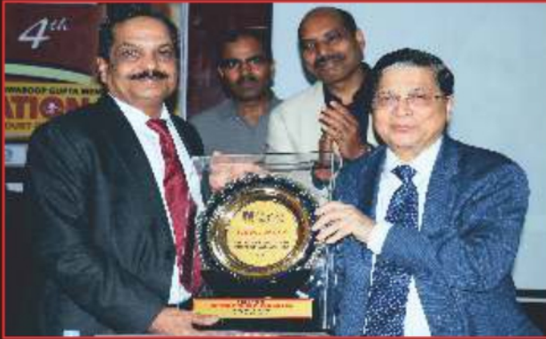
Hon'ble Mr. Justice Dipak Misra , Chief Justice of India, Chief Guest of the Inaugural Session of 4th Anand Swaroop Gupta Memorial National Moot Court Competition, 2019