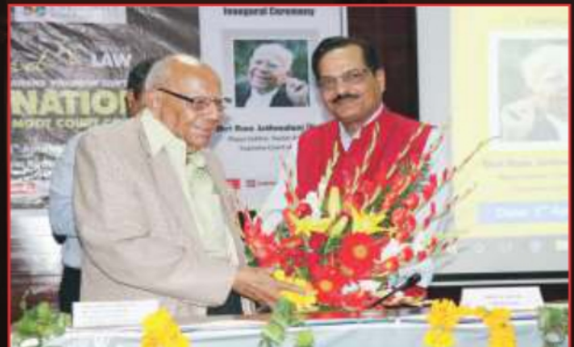
Hon'ble Shri. Ram Jethmalani , Senior Advocate, Chief Guest in the Inaugural Session, 3rd Anand Swaroop Gupta Memorial National Moot Court Competition, 2018