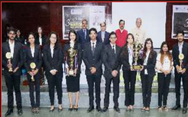
Winner team of 3rd Anand Swaroop Gupta Memorial National Moot Court Competition, 2018